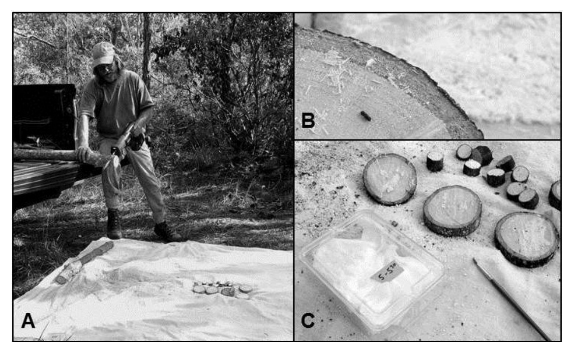
Fig. 1. Method for collection of live redbay ambrosia beetles, Xyleborus glabratus , using freshly-cut host wood as bait deployed in the late afternoon near trees symptomatic for laurel wilt. Branches from Persea spp. were cut into cross-sectional disks; cut wood and sawdust were placed in center of cotton sheet (A). Ambrosia beetles landing on the bait or surrounding sheet (B) were collected by hand with a soft brush and stored in plastic boxes containing moist tissue paper (C).

counted and identified according to Rabaglia et al. (2006), and voucher specimens deposited at SHRS (Miami, Florida) and at Archbold Biological Station (Lake Placid, Florida).